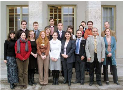
Kick-off meeting at IAMO, Halle, 2007

The new EU Member States (NMS) have undergone substantial rural economic sector restructuring and socio-economic transformation. Nevertheless, a great number of them still display tremendous disparity in most structural and socio-economic indicators as compared to the EU15 average; it is therefore imperative that significant structural changes in the labour force, farming, and rural economic sectors will happen. Understanding the dynamics of structural change and insights from up-to date survey data are fundamentally important and constitute the particular value of the 6 th framework project SCARLED.